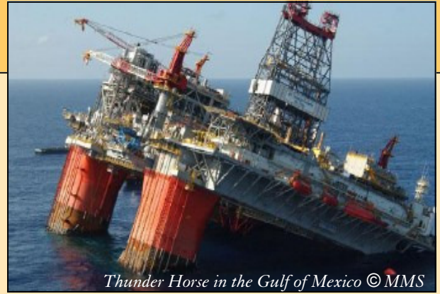
Thunder Horse in the Gulf of Mexico